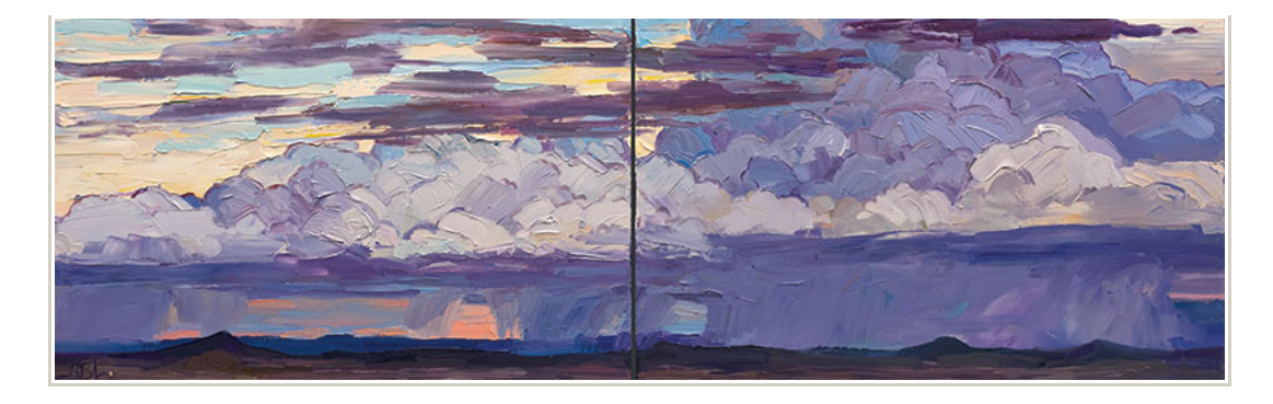
"Evening swell," oil on canvas, 20"H by 64"W

"I've always had a predilection for texture, and I use a lot of it these days," says Lee. "When a piece is dry, I love to rub my hands over it and feel the oils. I like the fact that paint is a material. There's something interesting cognitively about having an identifiable image come out of this raw, colored substance. You go up close, and it's completely unrecognizable, but then you step back and its a cloud or a mountain. For me, that's probably the most fun part of my work."