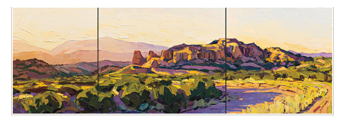
"On the Road to Chimayo," oil on panel, 30"H by 90"W

"I don't go to a location because other artists have been there or because it's been painted 10 million times before," he responds. "I go because I love it. I've painted Taos Mountain 30-some times now. The only voice you can find is your own, and everything else eventually is going to fall away."