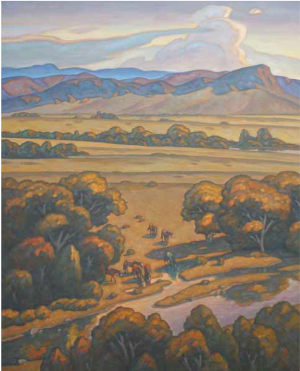
Creekside , oil, 52 x 42'