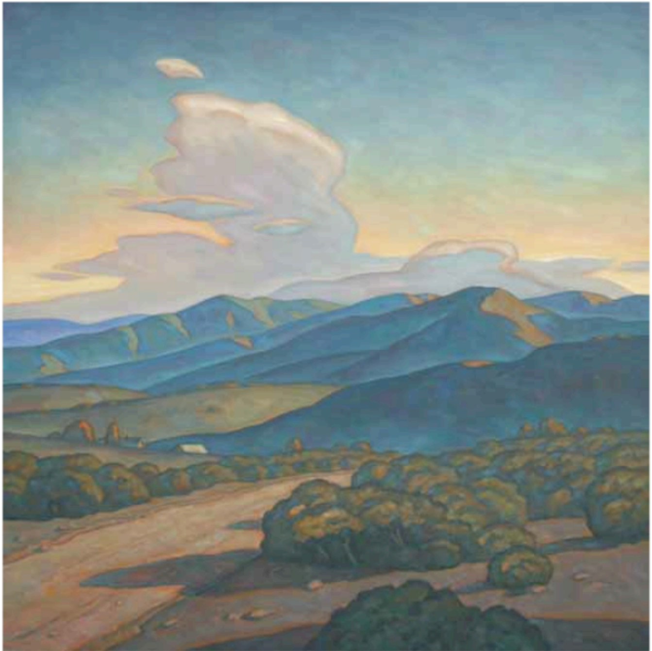
End of the Road , oil, 36 x 36"

"Creating the scene of the vista was fun. I enjoy the different strata of the landscape," says Post. "Those vistas allow you to see back into the landscape and let you dream a bit about the scene."