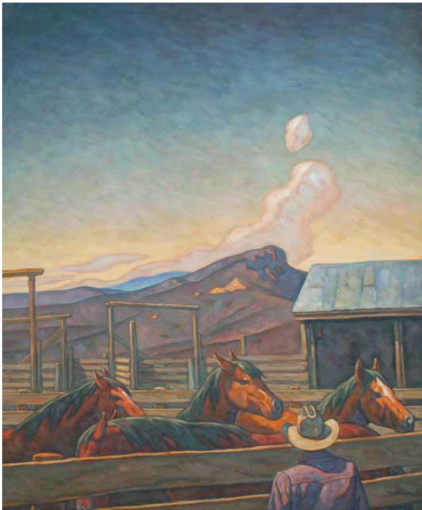
Ranch at Lonesome Butte , oil, 44 x 36"