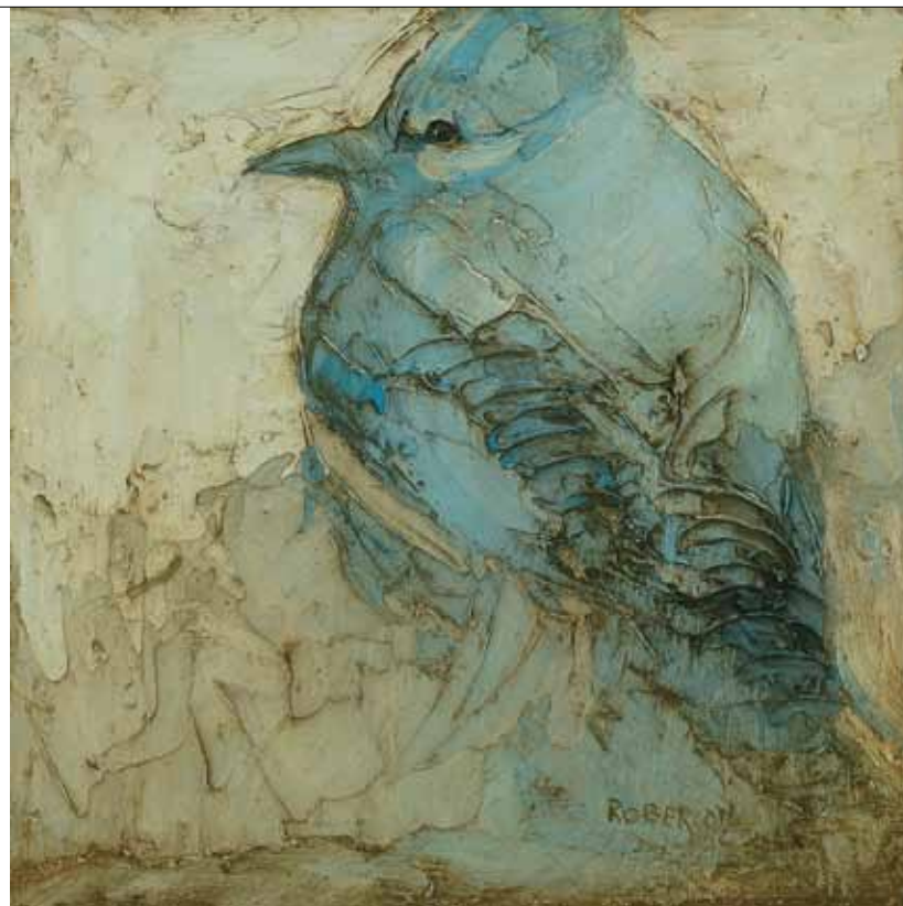
▲ Blue Jay, oil, 8 x 8. ◀ Tranquility, oil, 50 x 60.