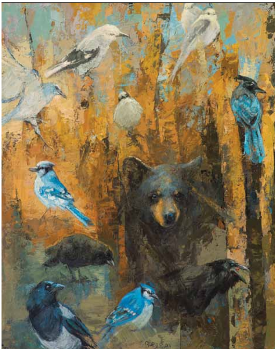
Corvids and Cub, oil, 50 x 40.