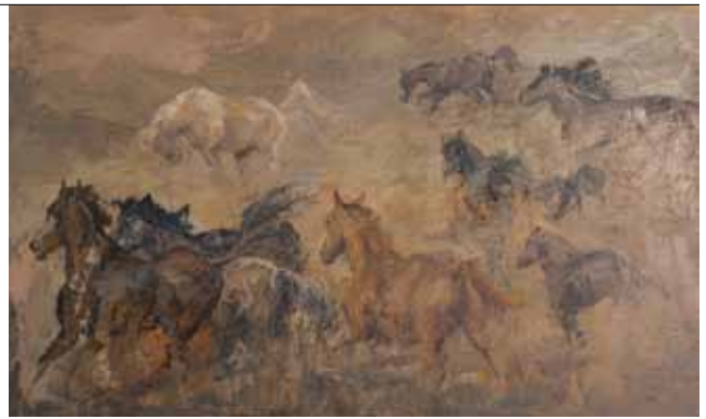
Wild Horses, oil, 36 x 60.