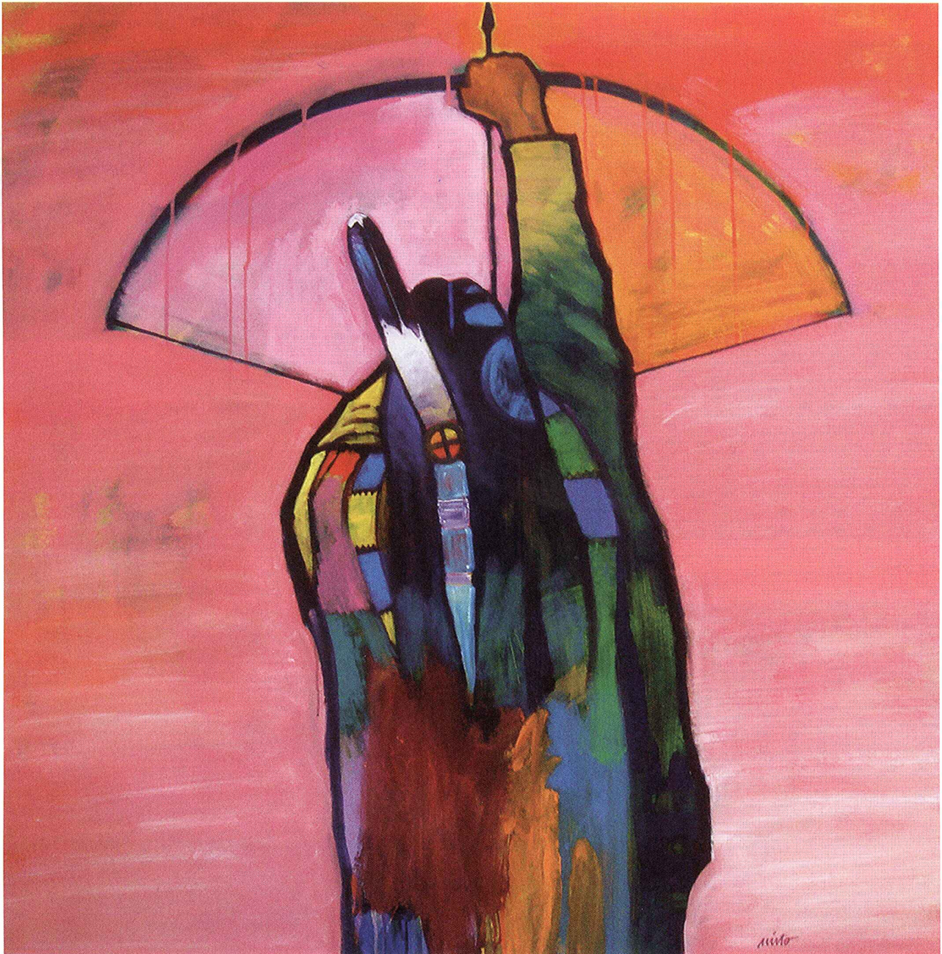
Enduring Archer , acrylic on canvas, 48 x 48"