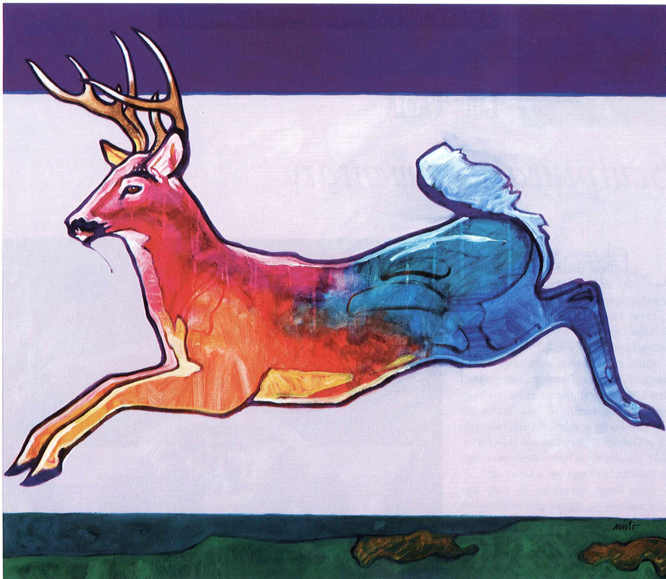
White Tailed Buck , acrylic on canvas, 40 x 44"

and meaningful to him. He then edits his ideas and paints about them rather than simply recreating photographic-like renditions. This emotional involvement with his subject matter results in powerful evocative paintings that reveal a seamless blend of instinct and keen intelligence.