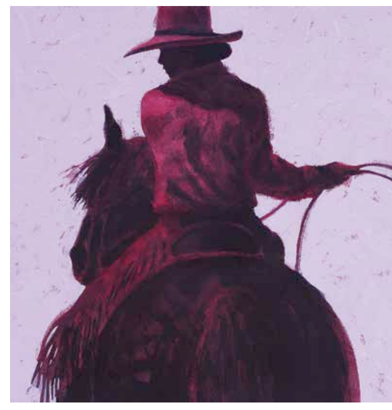
Chiquilla Rosa, oil, 24 x 24"