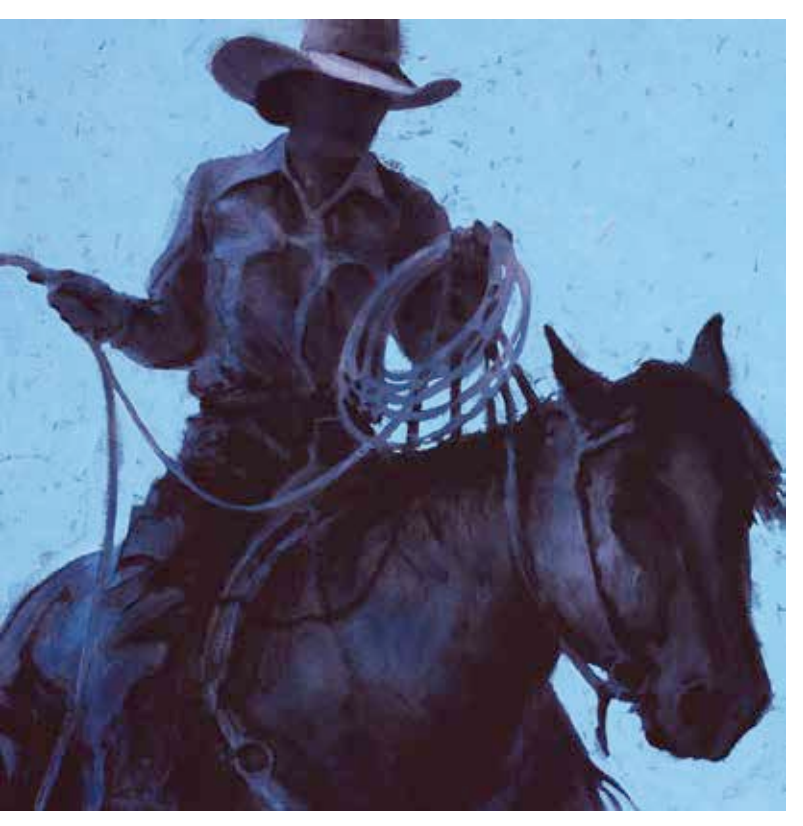
Chiquilla Azul, oil, 24 x 24"