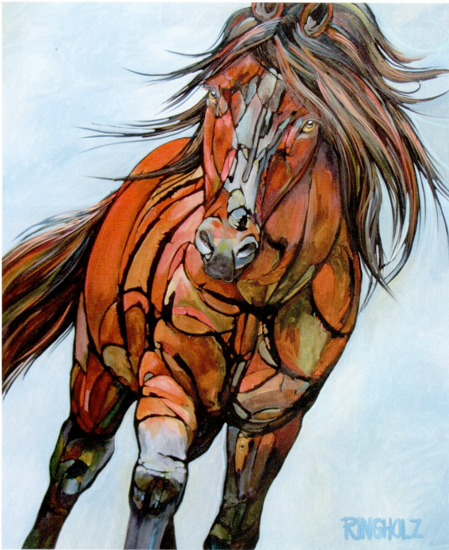
Amy Ringholz, Miracle , oil on canvas, 72 x 60"