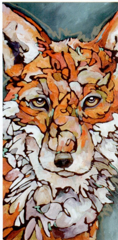
Amy Ringholz, Sunset Red , oil on canvas, 24 x 12"