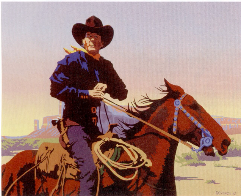
Distant Dust Clouds , oil on canvas, 20 x 24"

recall our memories of images of the West but with the colors punched up in a startling and artful way. The paintings, either small or large, appear larger than life, just like the West, and just like their creator.