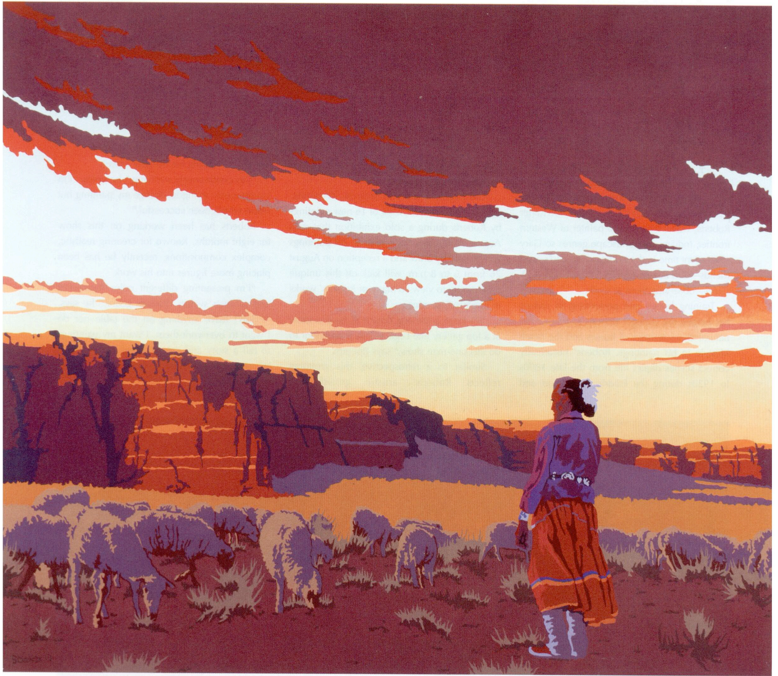
Sheep at Katsina Mesa , oil on canvas, 32 x 38"

detail and producing a simple line drawing. Having overcome his weakness at drawing, he brought in his skill with color, building it up to enliven the image. His genius is in describing a desert mesa, a horse, or clouds with as little detail as possible which, combined with his use of color, produces a believable image.