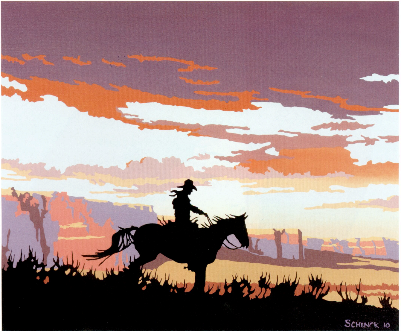
The Gathering Storm , oil on canvas 18 x 22"