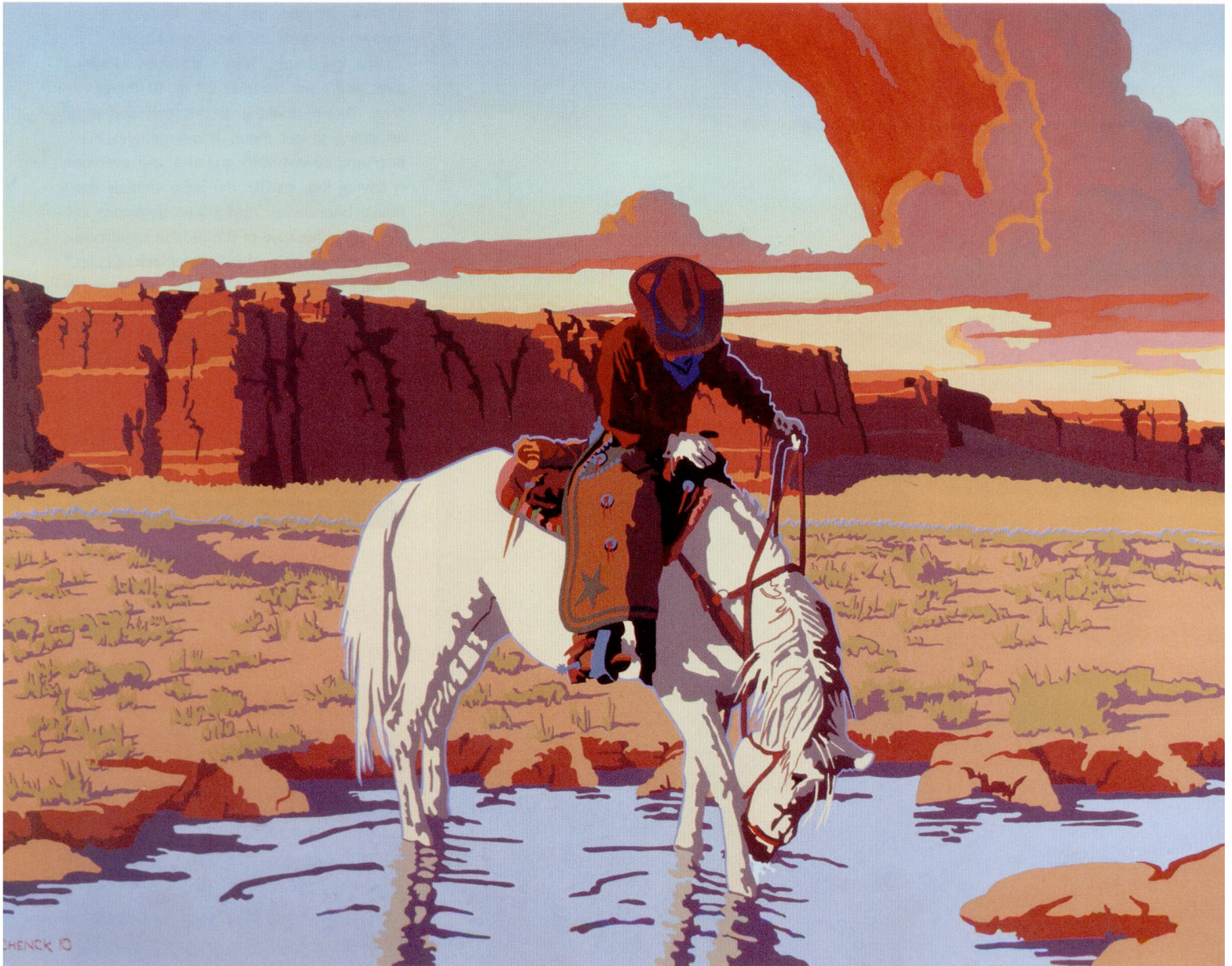
Water Hole , oil on canvas, 30 x 40"

Schenck appropriates his subjects from Western movies and other sources and combines the elements into compositions that