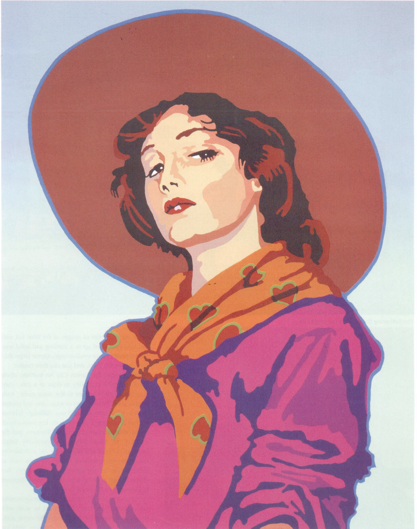
Not a Chance , oil on canvas, 20 x 16"